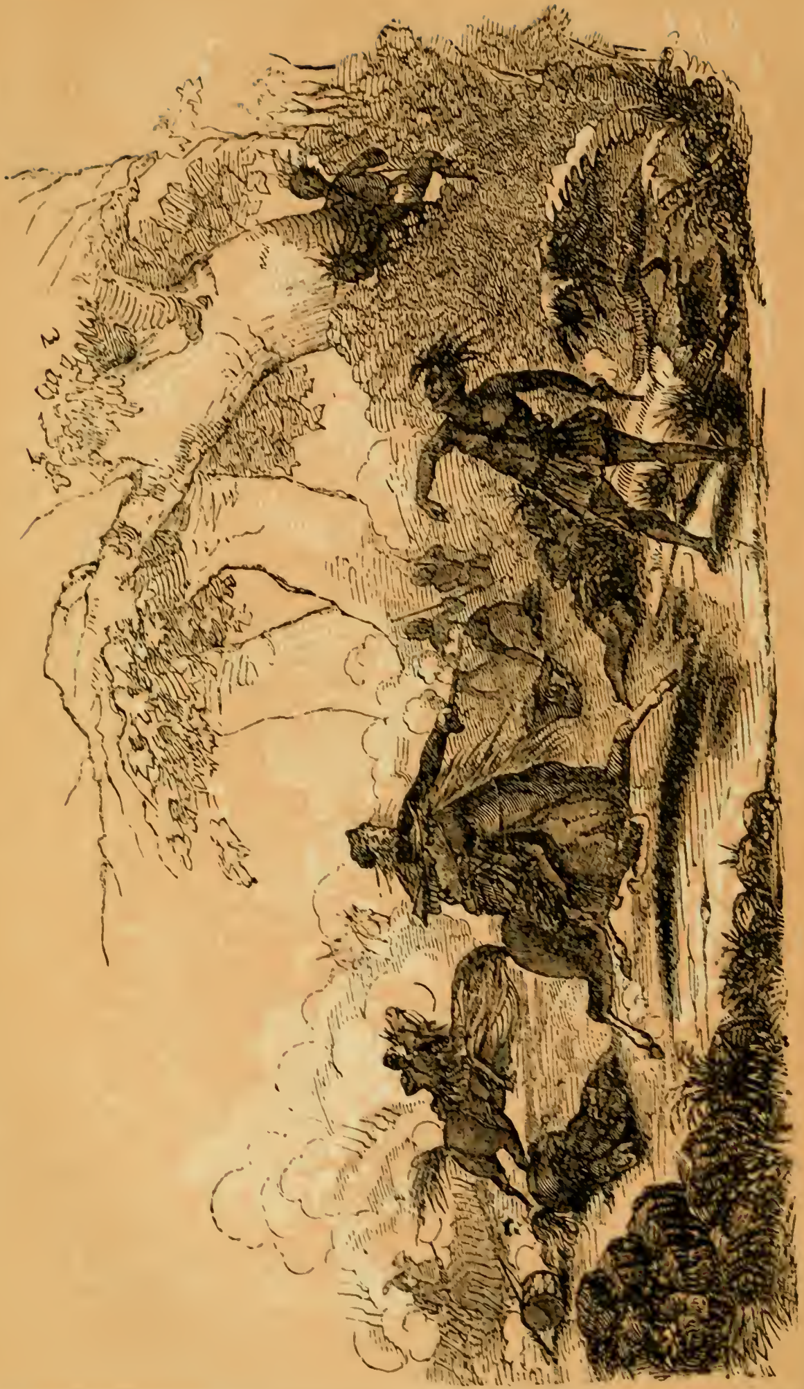
BATTLE WITH THE INDIANS — DEATH OF TEGUMSEH.